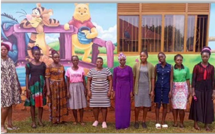
Primary Grade Teachers