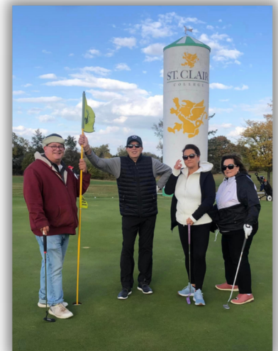
Golf at Woodland Hills raising $1,385

Here are a few of our successful fundraisers in 2021/2 Our budget relies on over $30,000 from our fundraising efforts. Special requests from SAC Buikwe (U) came to our attention, such as the washrooms needing replacement. A campaign was started and with the support of our Sponsors & Donors we were able to hit our target.