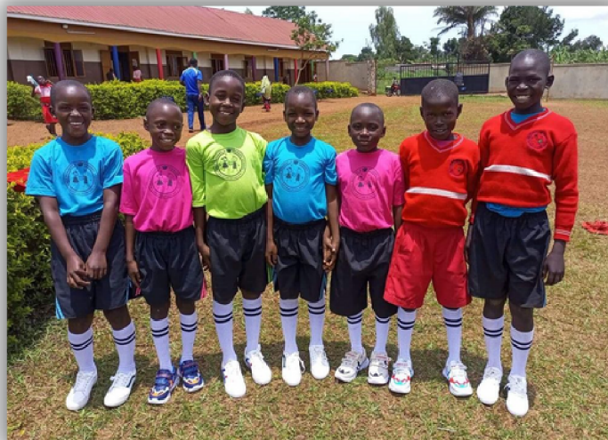
Classroom uniforms & & sport uniforms with sport shoes

COVID brought challenges such as at home learning. A totally different experience as many of the students did not have laptops or electricity at home to power them. Refurbished laptops were purchased and the students were allowed to work at SACU sharing a laptop sometimes between 2-3 students.